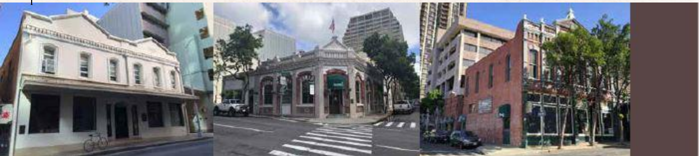
Top: Ca. 1885 photo taken from intersection of Merchant and Bethel Streets facing south-southeast. Right foreground shows the Kamehameha V Post Office building in its original state. The old Honolulu Hale is visible behind it. The Melchers Building is in the left midground; many original design elements are still visible, including quoins and a hipped roof. Above left to right: The Friend Building · Royal Saloon Building · T. R. Foster Building (fronting Nu'uauu Avenue) with small brick warehouse (fronting Marin Street) at rear.

In November 2021 the Hawai'i Historic Places Review Board approved an update and amendment to the Merchant Street Commercial and Civic Historic District listing on the Hawai'i State Register of Historic Places. The original nomination was approved in 1973. This amended form provides much needed clarification, along with expanded description and significance sections, details the district's history as well as its architectural character, and has added two buildings to the district (The Honolulu Star-Bulletin Building and the Alexander & Baldwin Building). Other new resources added to this district nomination are the site of the original Honolulu Hale and four objects: granite curbs and sidewalks, lava rock curbs, cannons, and a remnant of a cast-iron storefront.