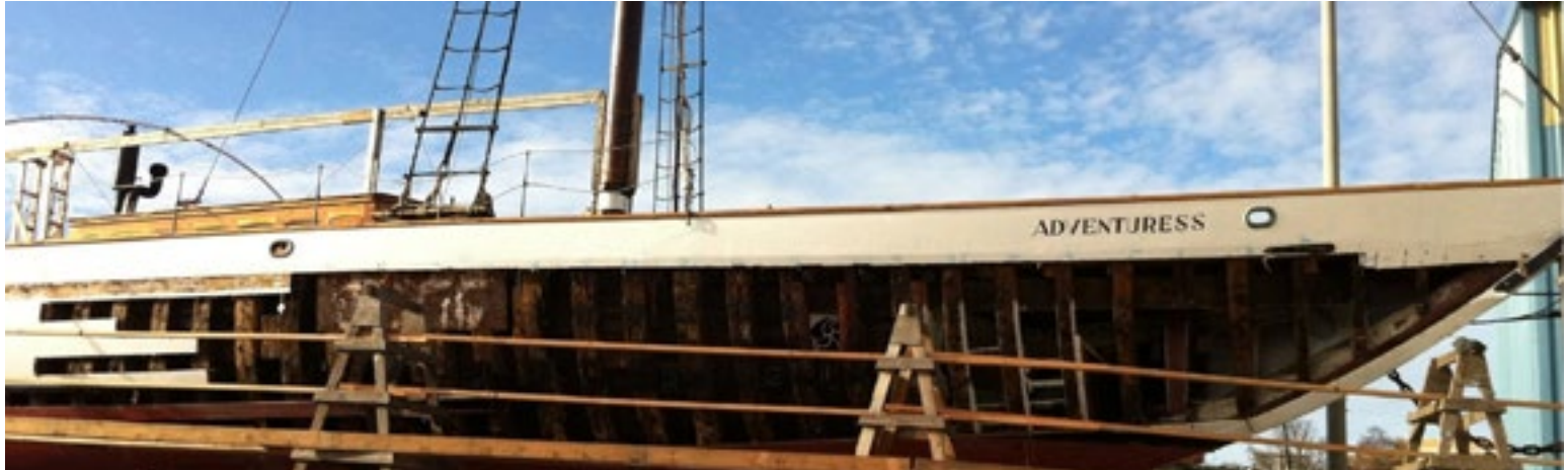
Restoration of the Schooner Adventuress