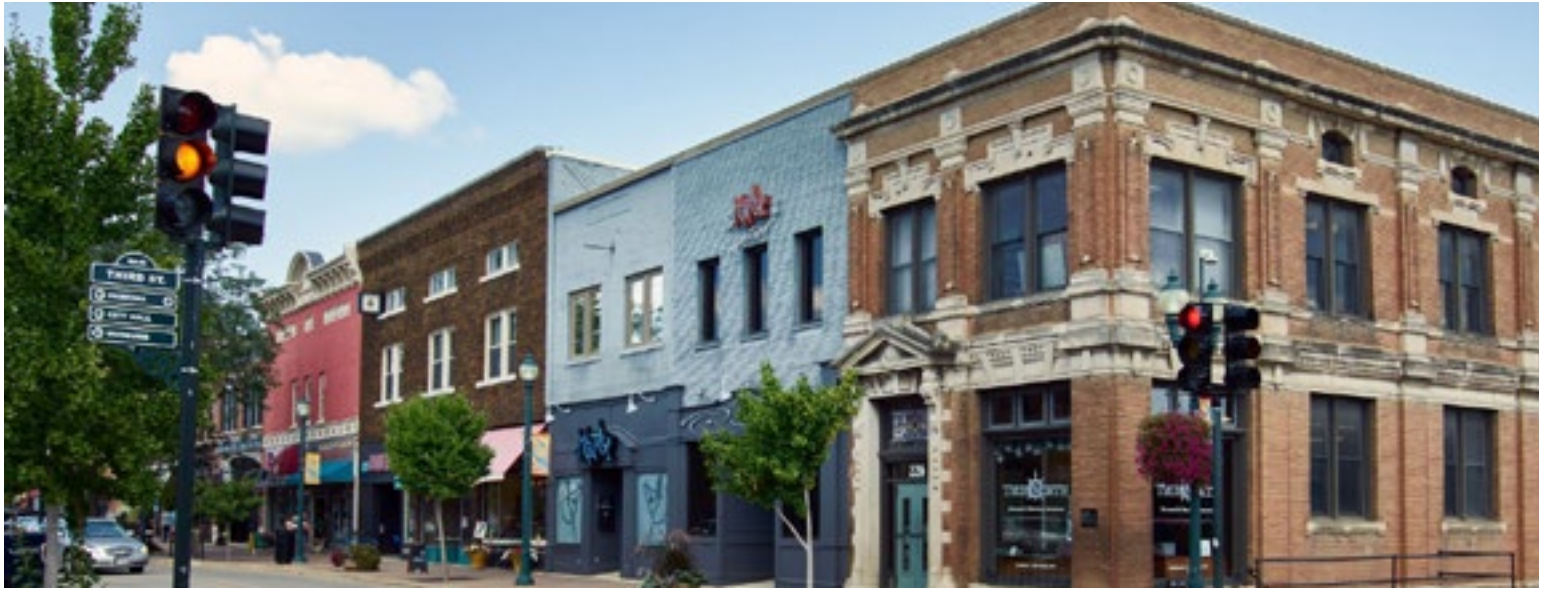
Cedar Falls, Iowa.