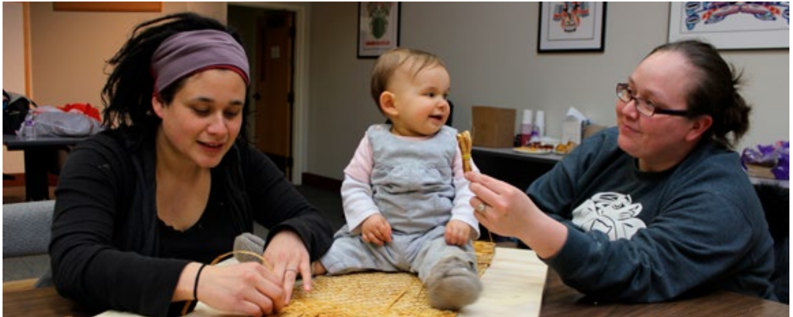
Experienced artists and skilled instructors work with Makah youth to study and replicate pre-contact artifacts made by their ancestors.