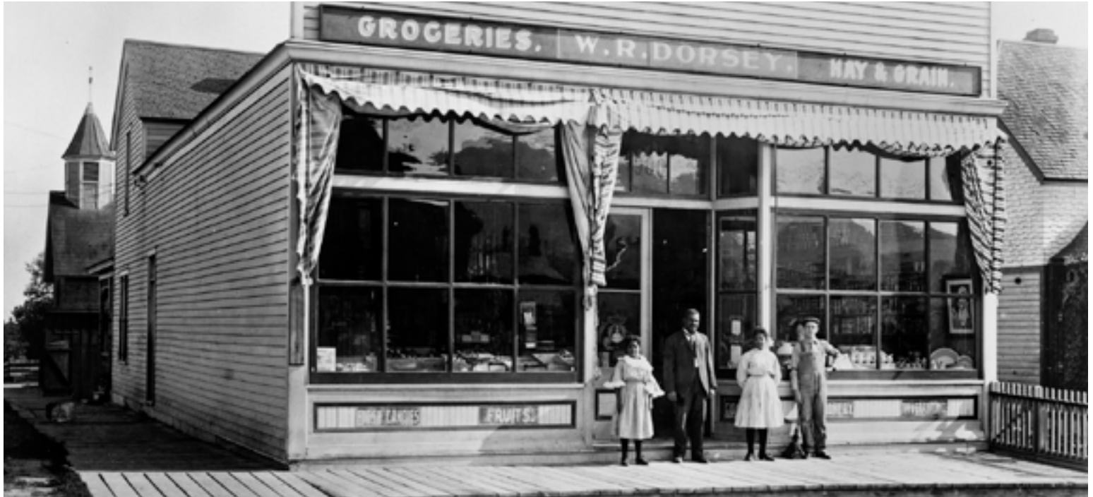
W.R. Dorsey grocery store in Helena, MT.