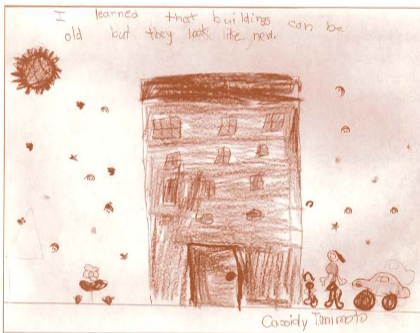
Aina Haina Elementary 2nd grader.

sented to projects that represented diverse and creative examples of preservation effort in the Islands; Ku'u Home Kulaiwi, Kane'aki Heiau, Loko I'a o He'eia, Mission Houses Museum, W.H. Shipman House, Bill and Jean Lane Visitor Center at National Tropical Botanical Garden at Lawai and the preservation plan for Kapinao Heiau.