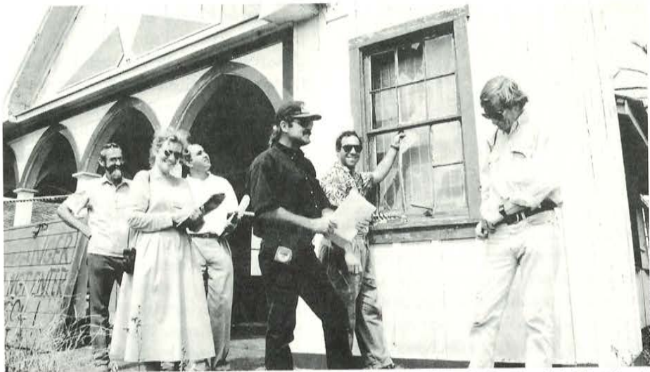
Project 'Iniki's technical assessment team at work at Kaumakani United Methodist Church in West Kaua'i.