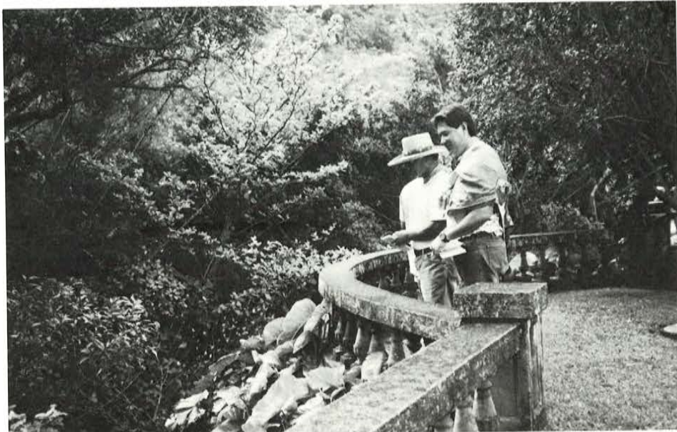
"Holoholo i Nu'uano," the 1990 Preservation Parade offered members an opportunity to visit some of the stately, historic houses located in Nu'uano Valley on O'ahu.

First Hawaiian Bank DFS Hawai'i Hawaiian Electric Industries Louis Vuitton Hawai'i, Ltd. Pacific Resources, Inc. Deloitte & Touche Star Market, Ltd. Sea Life Park/Waimea Falls Park