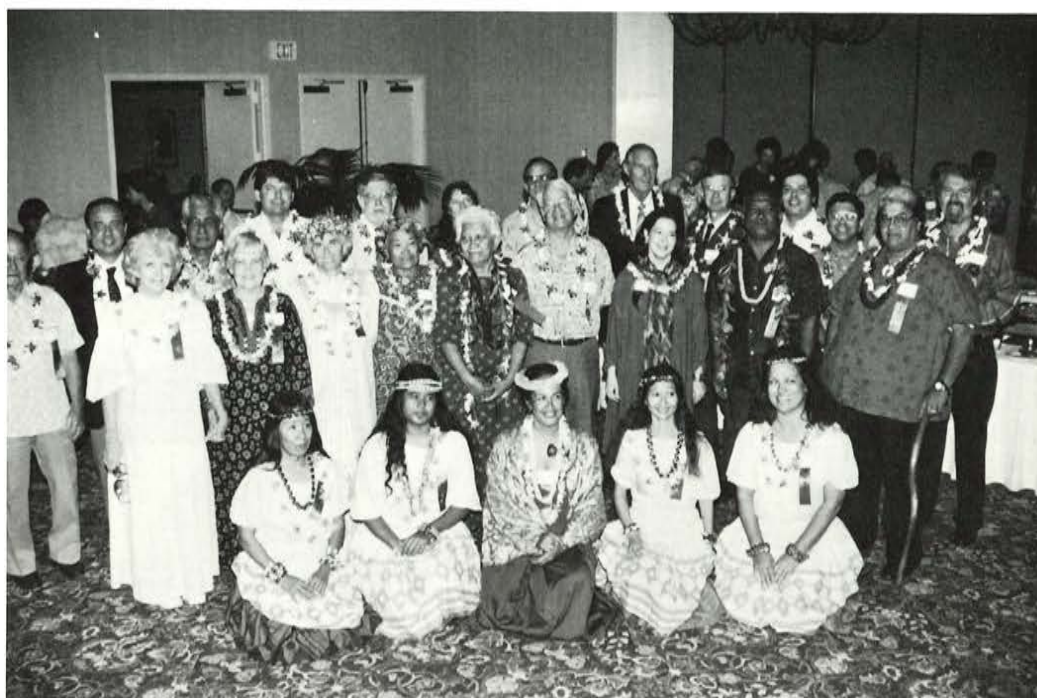
Recipients of the 1990 Preservation Honor Awards.