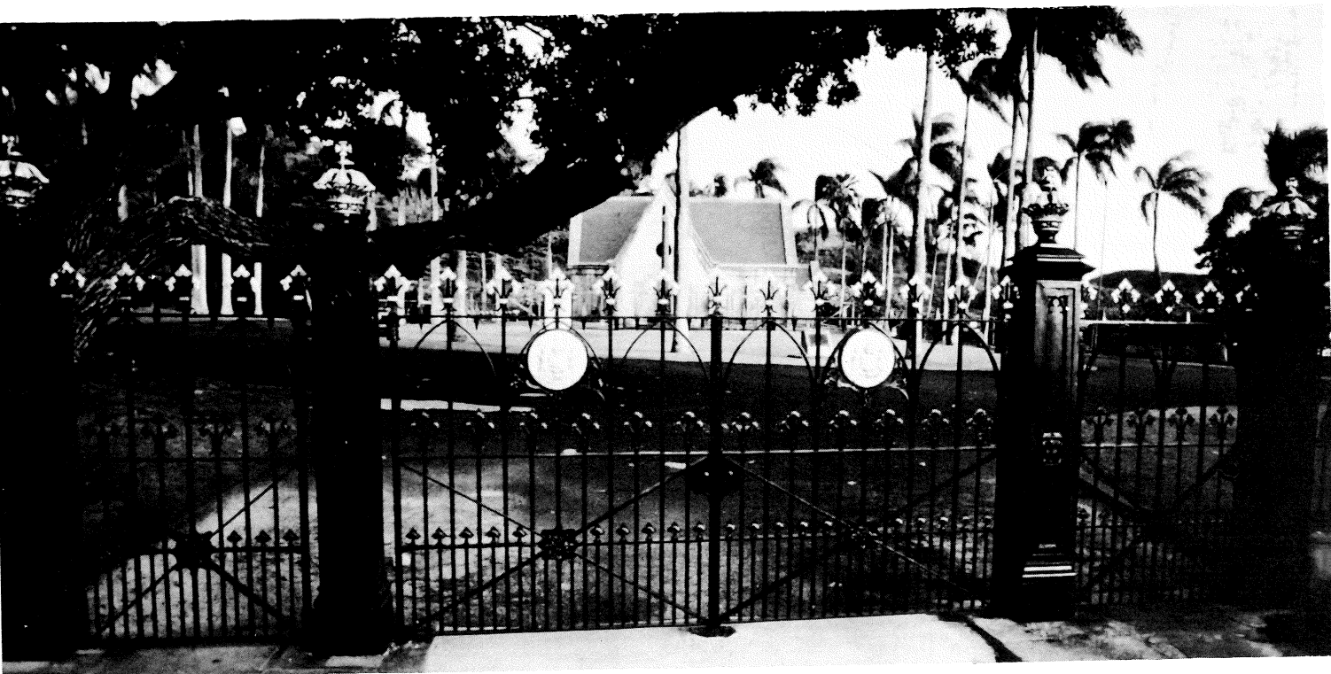
The iron gates and fencing fronting the Royal Mausoleum in Nu'uano were originally brought from England in 1867. They received little or no maintenance until 1984 when the Trustees of the Charles R. Bishop Trust commissioned their restoration. The entire structure was restored as accurately as possible to its original condition. It was completely repaired and freshly painted with all finials, spear tips, coat of arms and crowns gilded in 23 carat gold leaf.