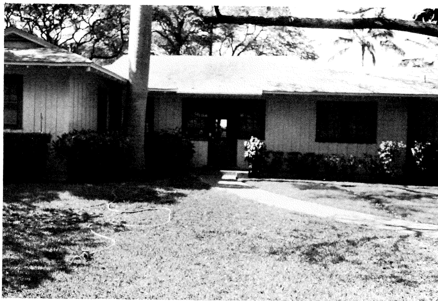
Military housing on Ford Island was originally built in 1922. Thirty-eight of these pre-World War II family quarters still house military families. After 60 years of service, the historic homes were in need of major repairs and renovation. In 1983 a proposal was submitted for the repair and rehabilitation of 33 of the Ford Island family units. The project was completed by the Navy Public Works Center at Pearl Harbor.