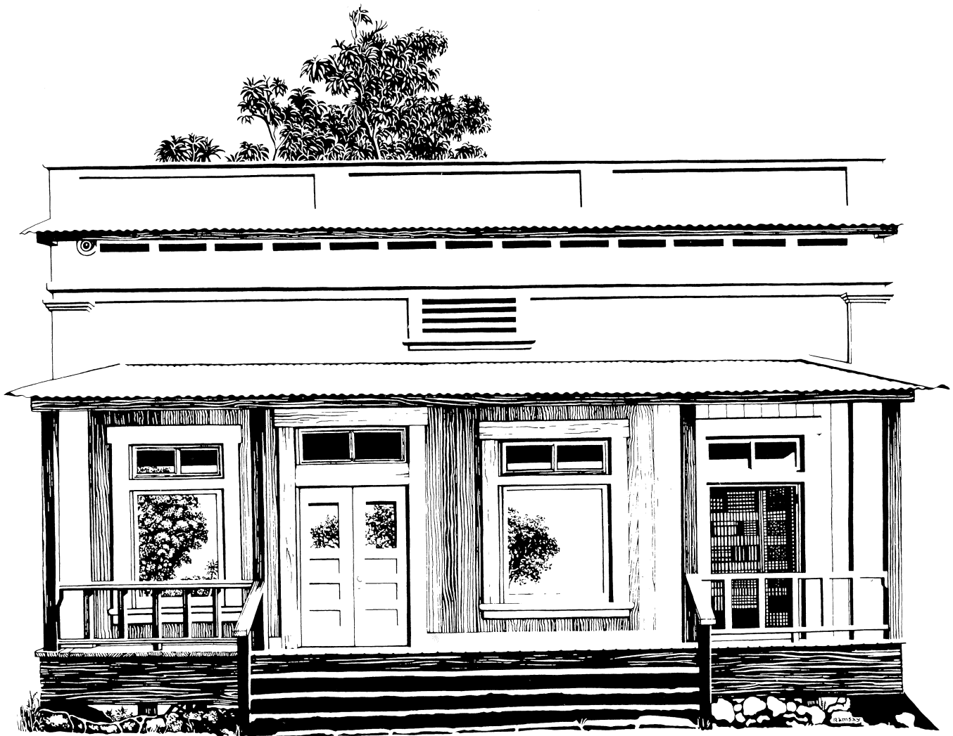
THE CHANG FOOK BUILDING