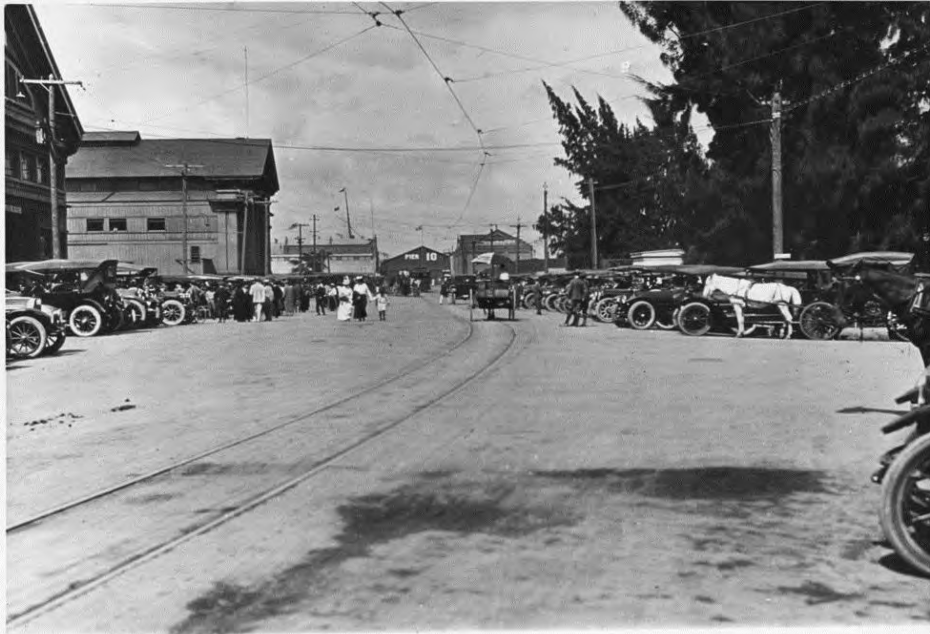
1915 Gathering at Honolulu Harbor