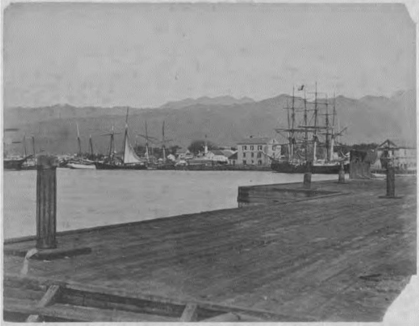
1880 View of Custom House from Wharf