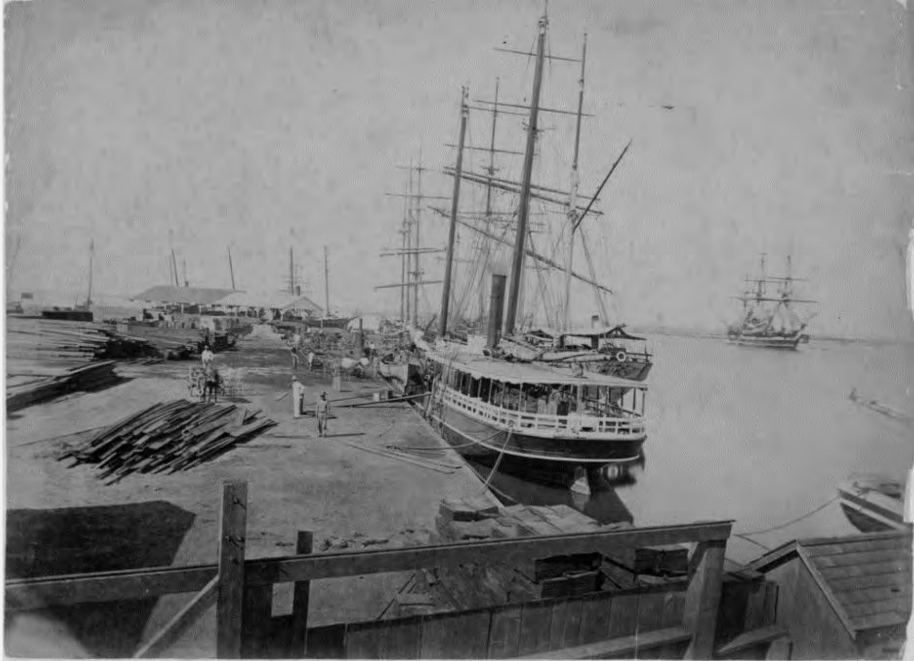
1885 Honolulu Wharf