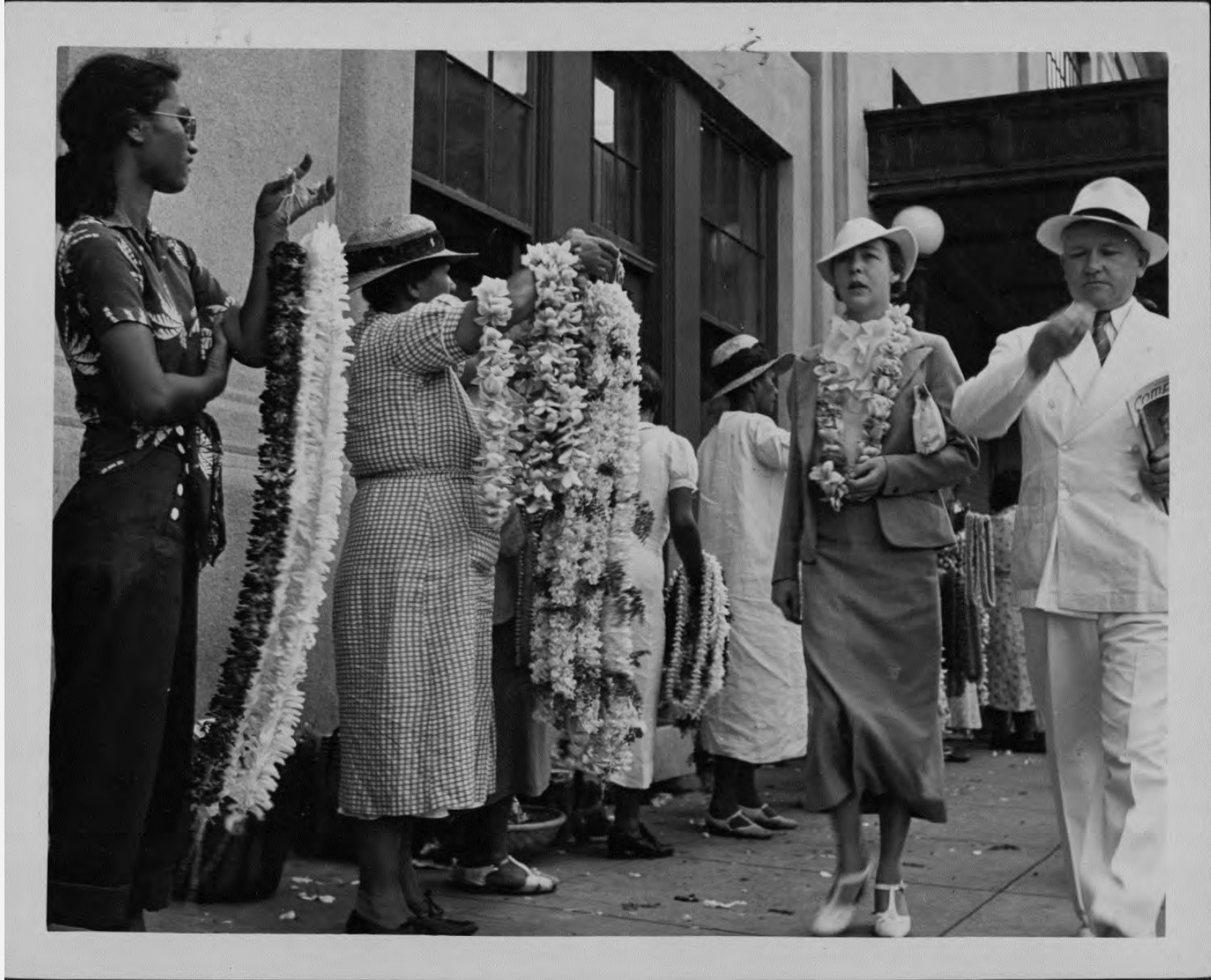
1935 Lei Sellers at the Waterfront