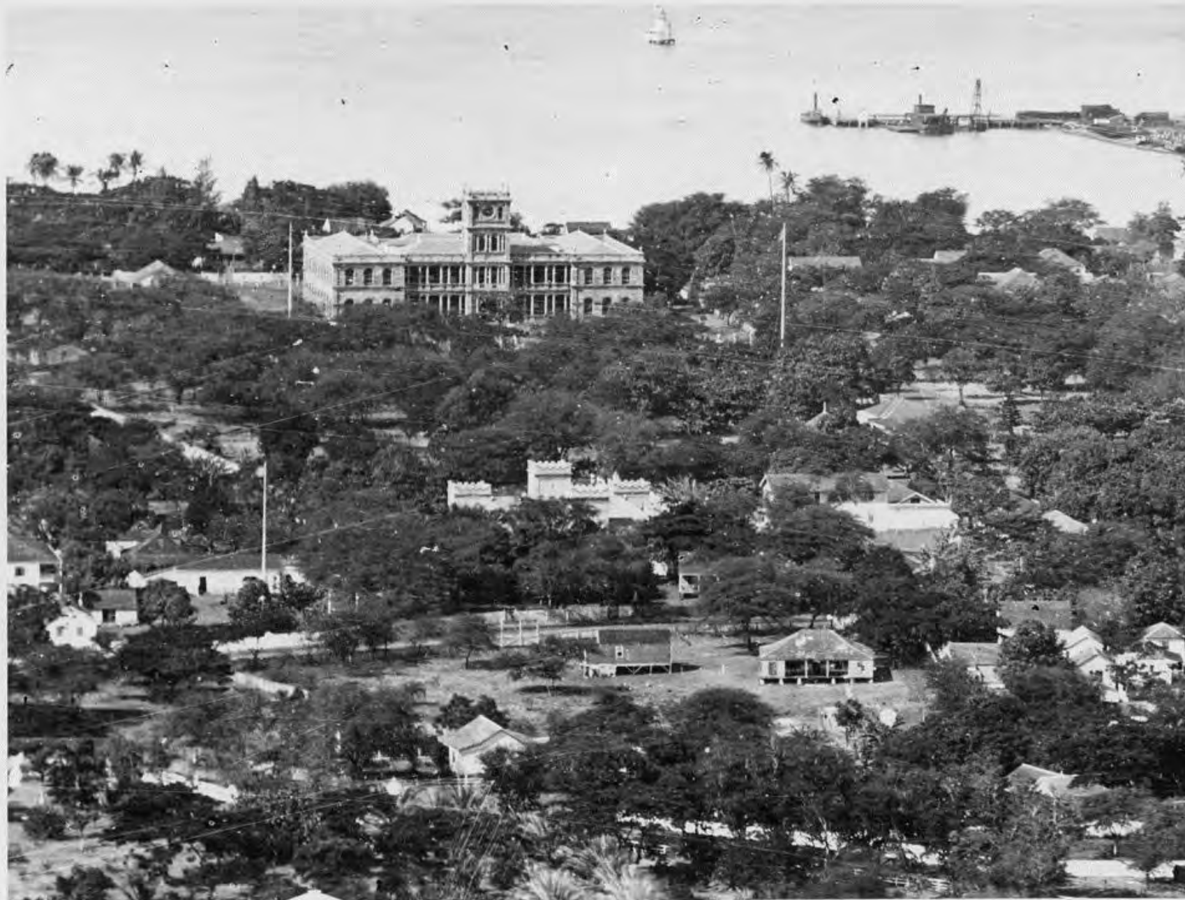
1870s Detail View From Punchbowl