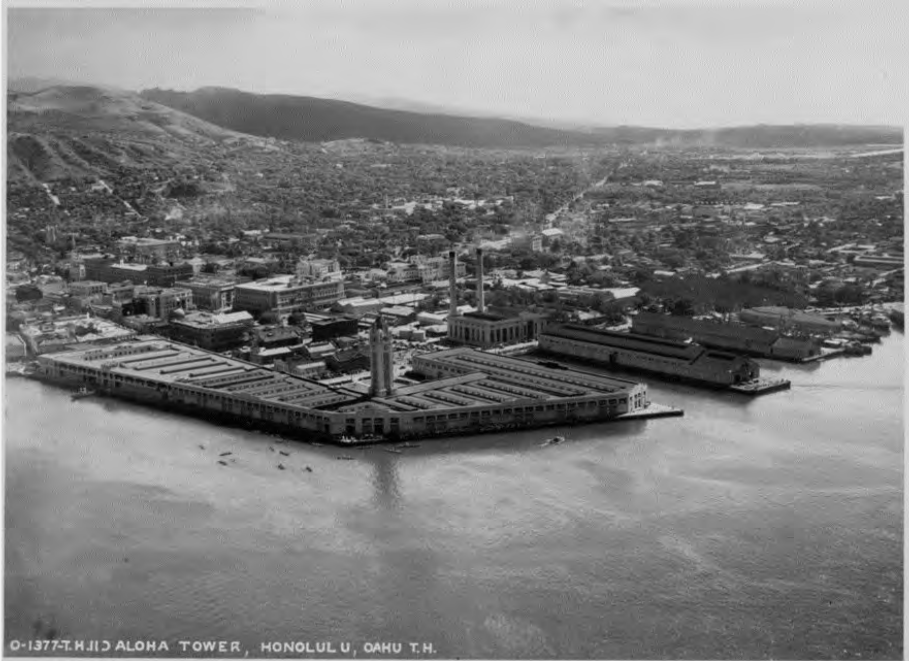
O-1377-T.H.113 ALOHA TOWER, HONOLULU, OAHU T.H.