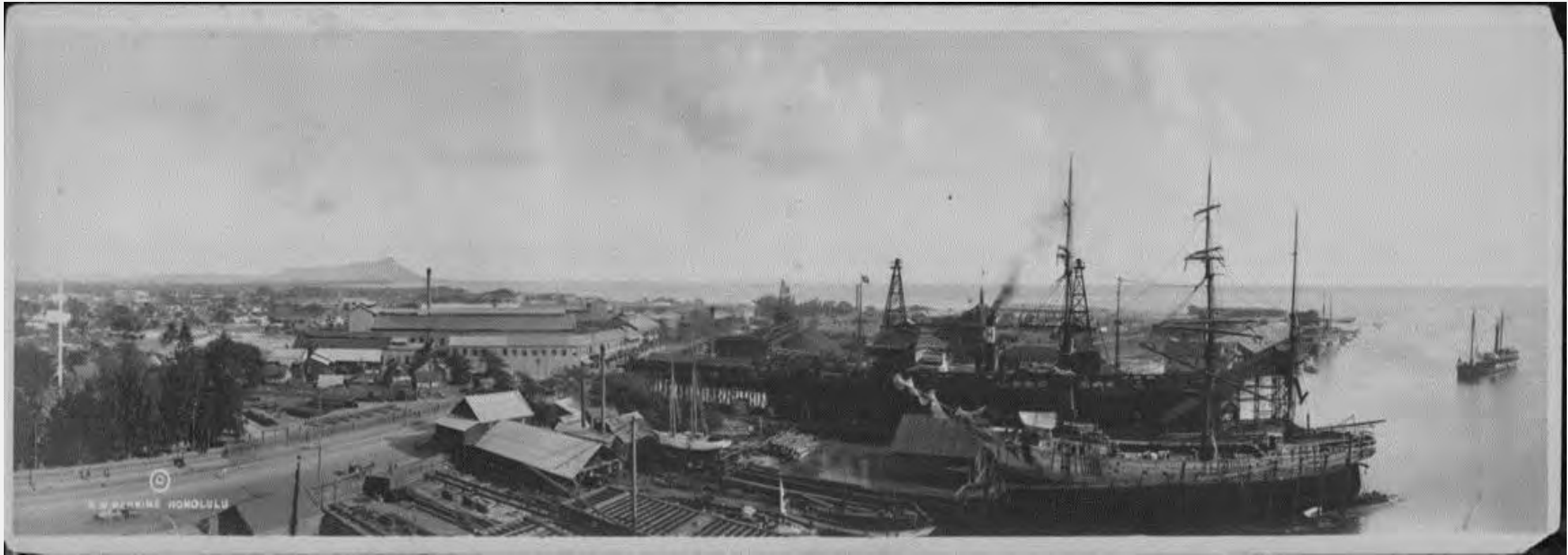
1902 Inter-Island Steamship Co. Dry Dock