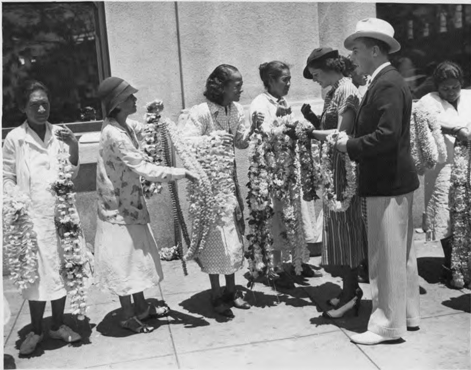
1935 Lei Sellers at the Waterfront