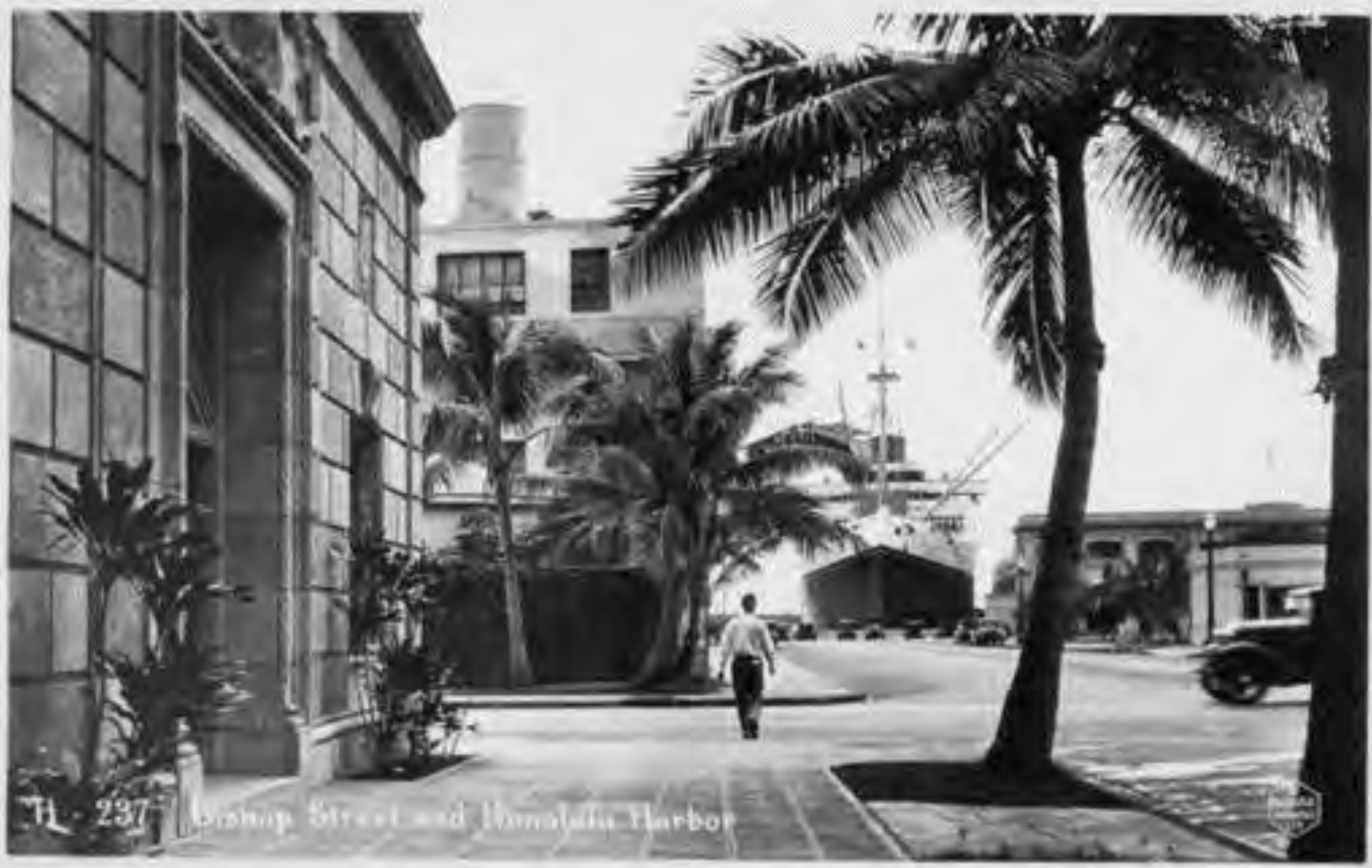
TL 237 Bishop Street and Honolulu Harbor