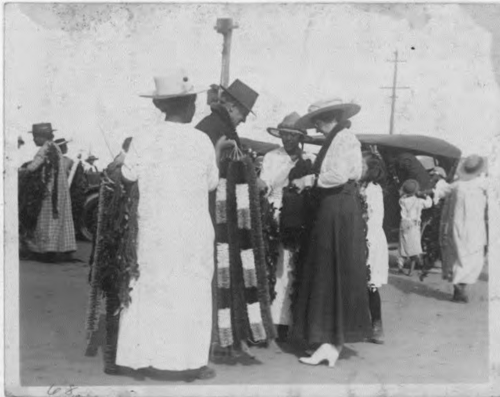
1915 Lei Sellers and Customers at the Waterfront