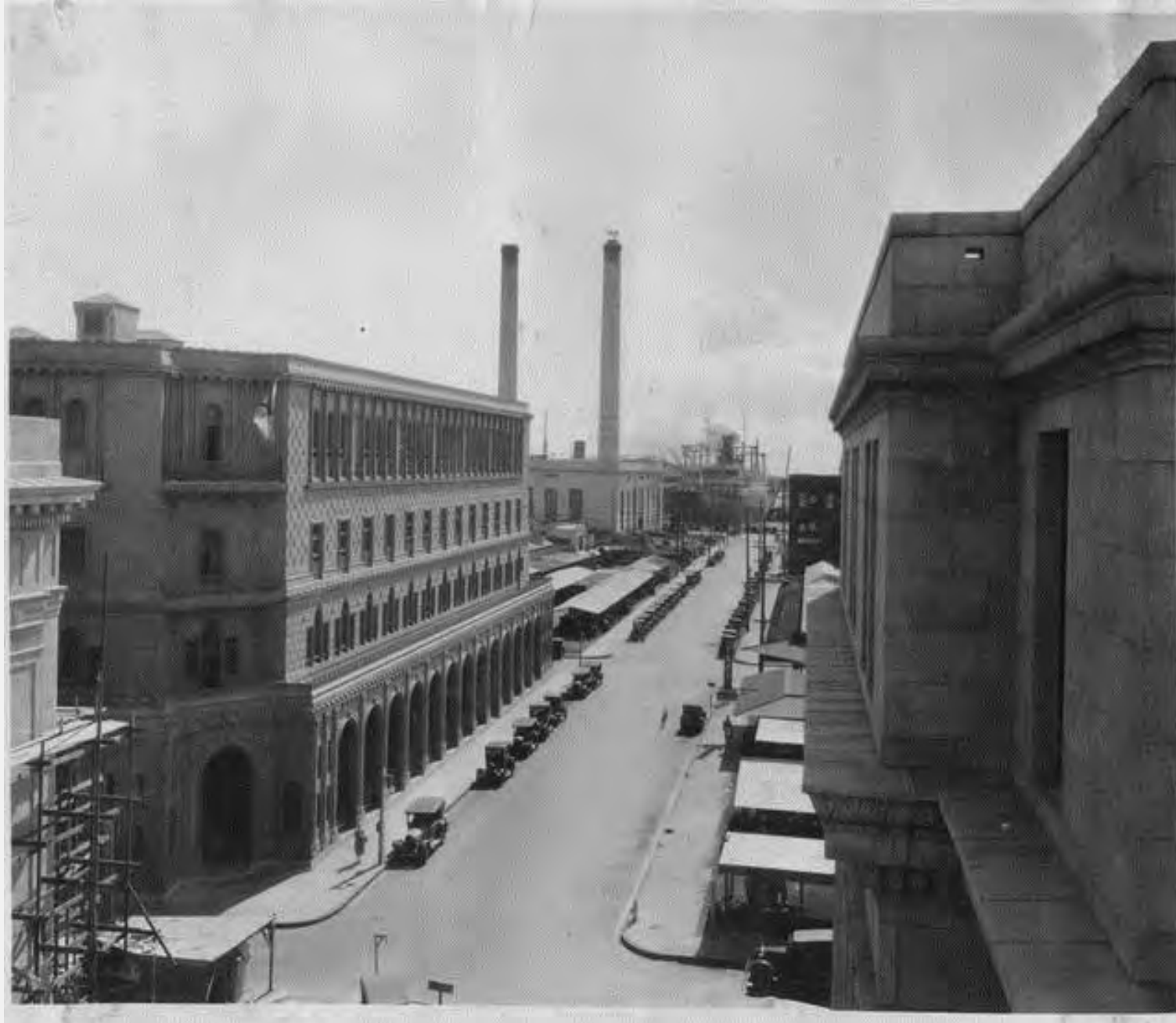
1920 View Down Bishop Street