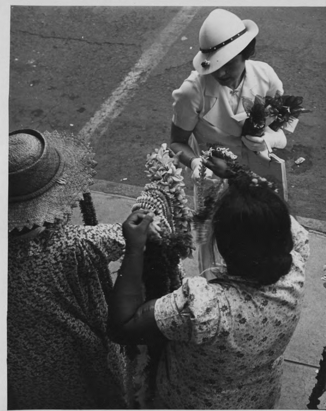
1937 Lei Sellers at the Waterfront