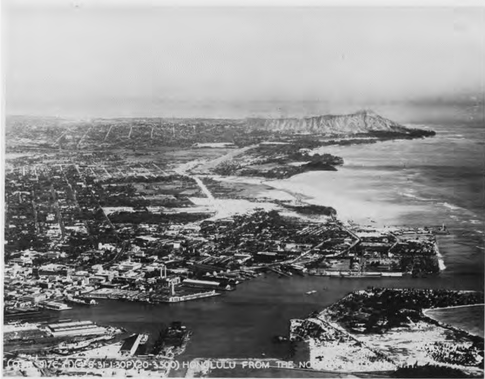
(20-3500) HONOLULU FROM THE NORTH