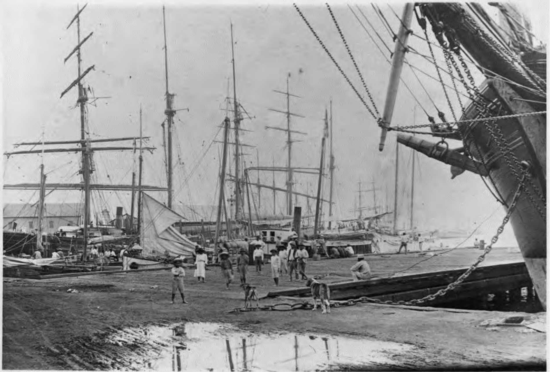
1900 Waterfront Esplanade