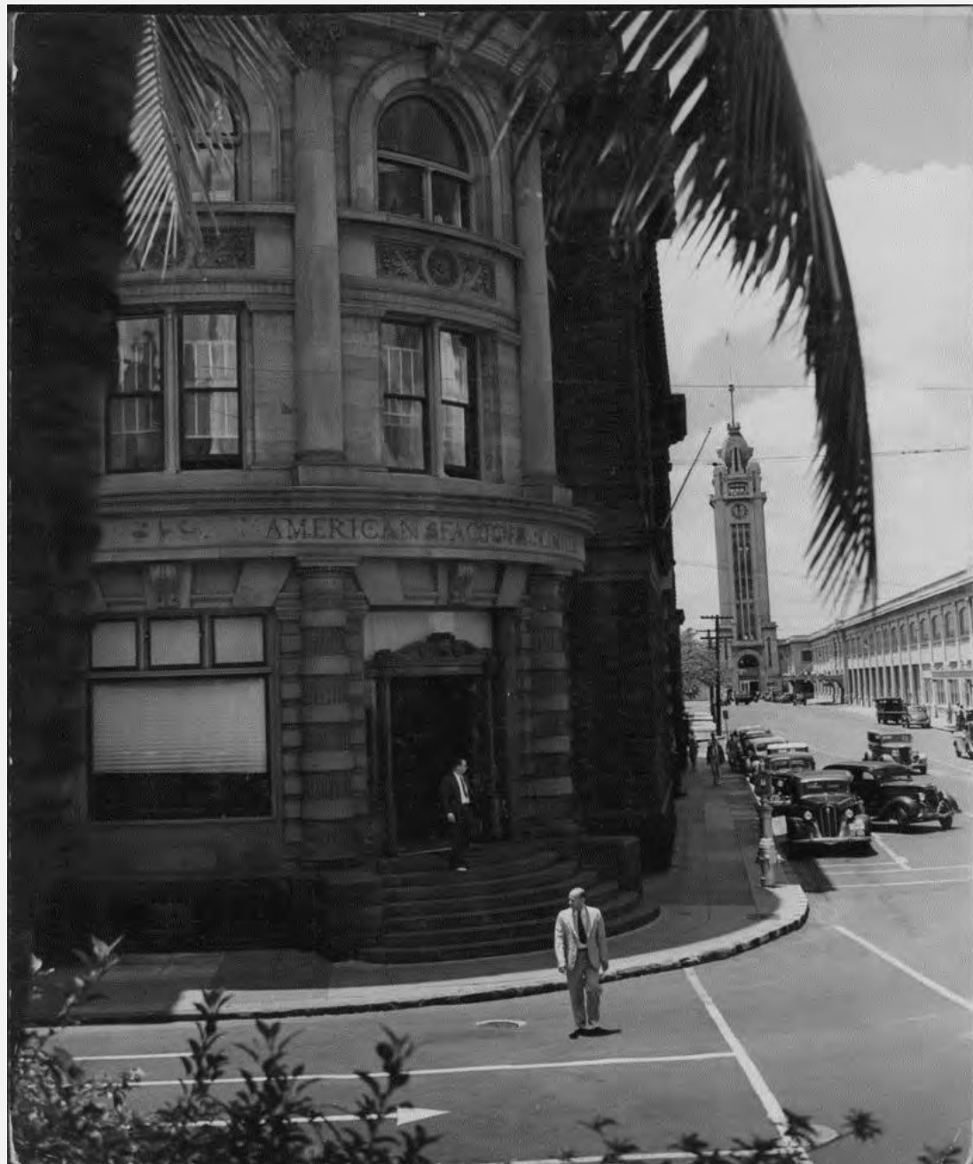
1939 American Factors Ltd and Aloha Tower