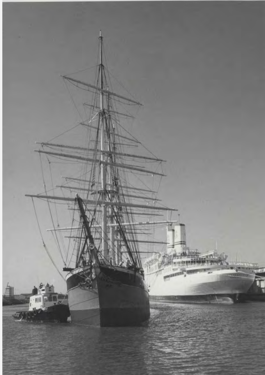
1963 Falls of Clyde