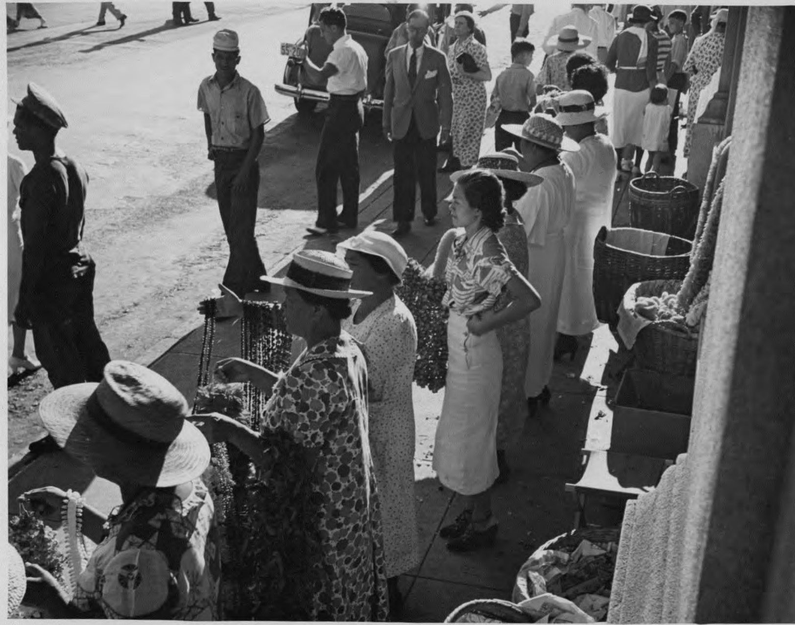
1937 Lei Sellers at the Waterfront