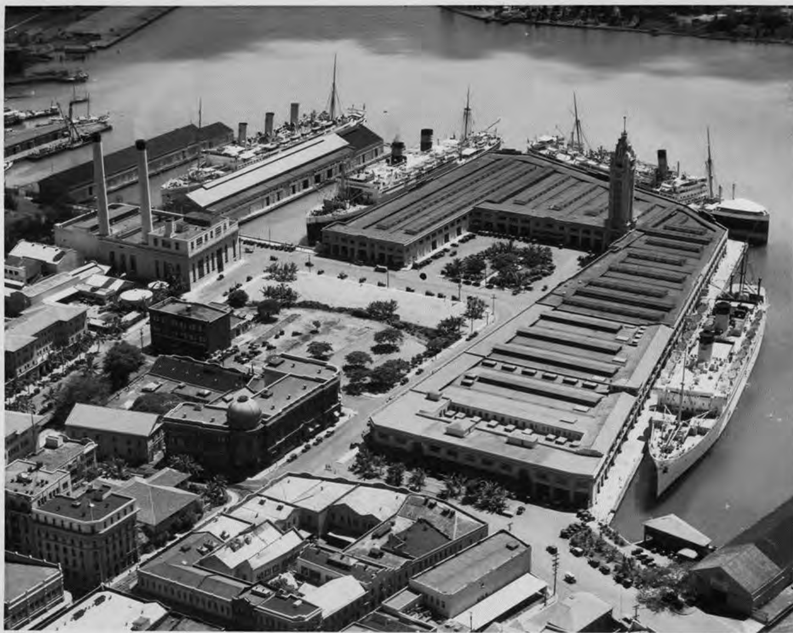
1930s Before the Nimitz Highway