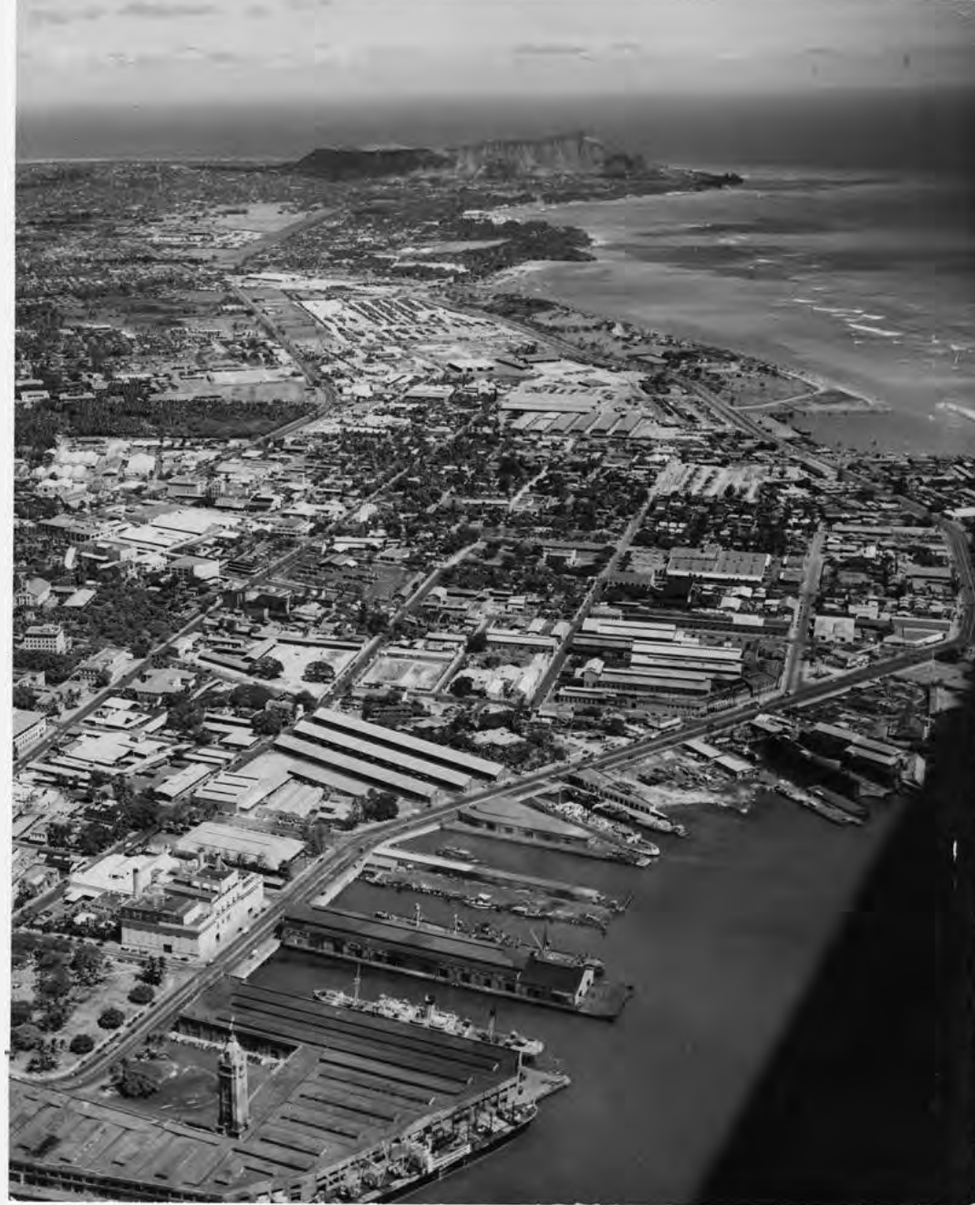
Aloha Tower with Camouflage Paint