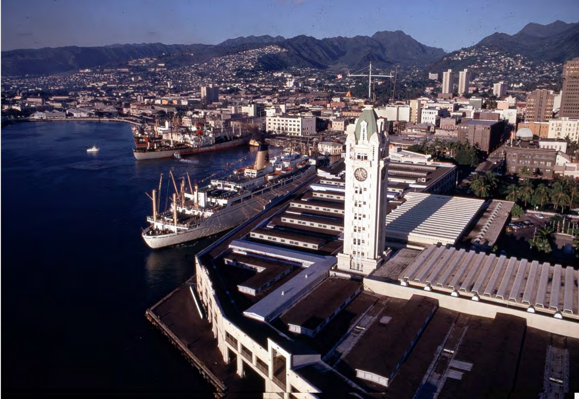
1960s S.S. Mariposa