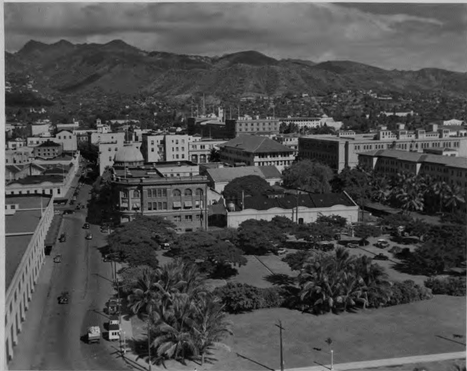
1937 View From Aloha Tower