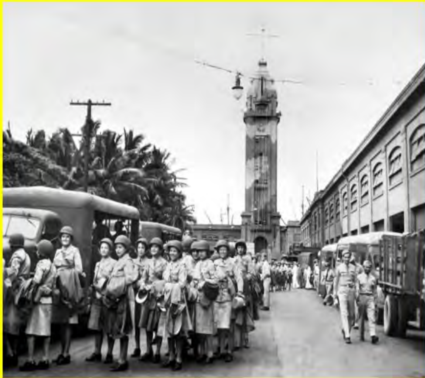
Aloha Tower During WWII