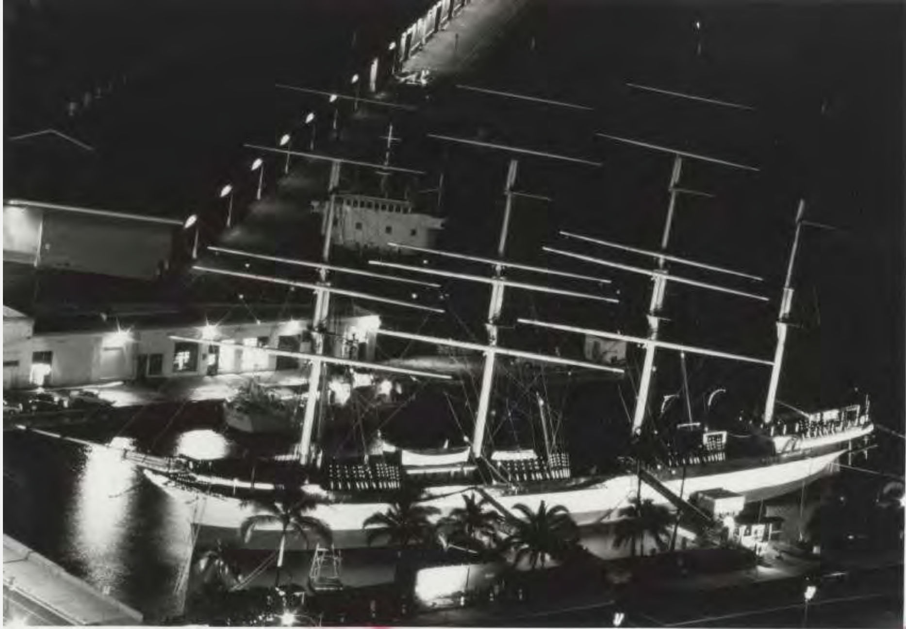
1963 Falls of Clyde