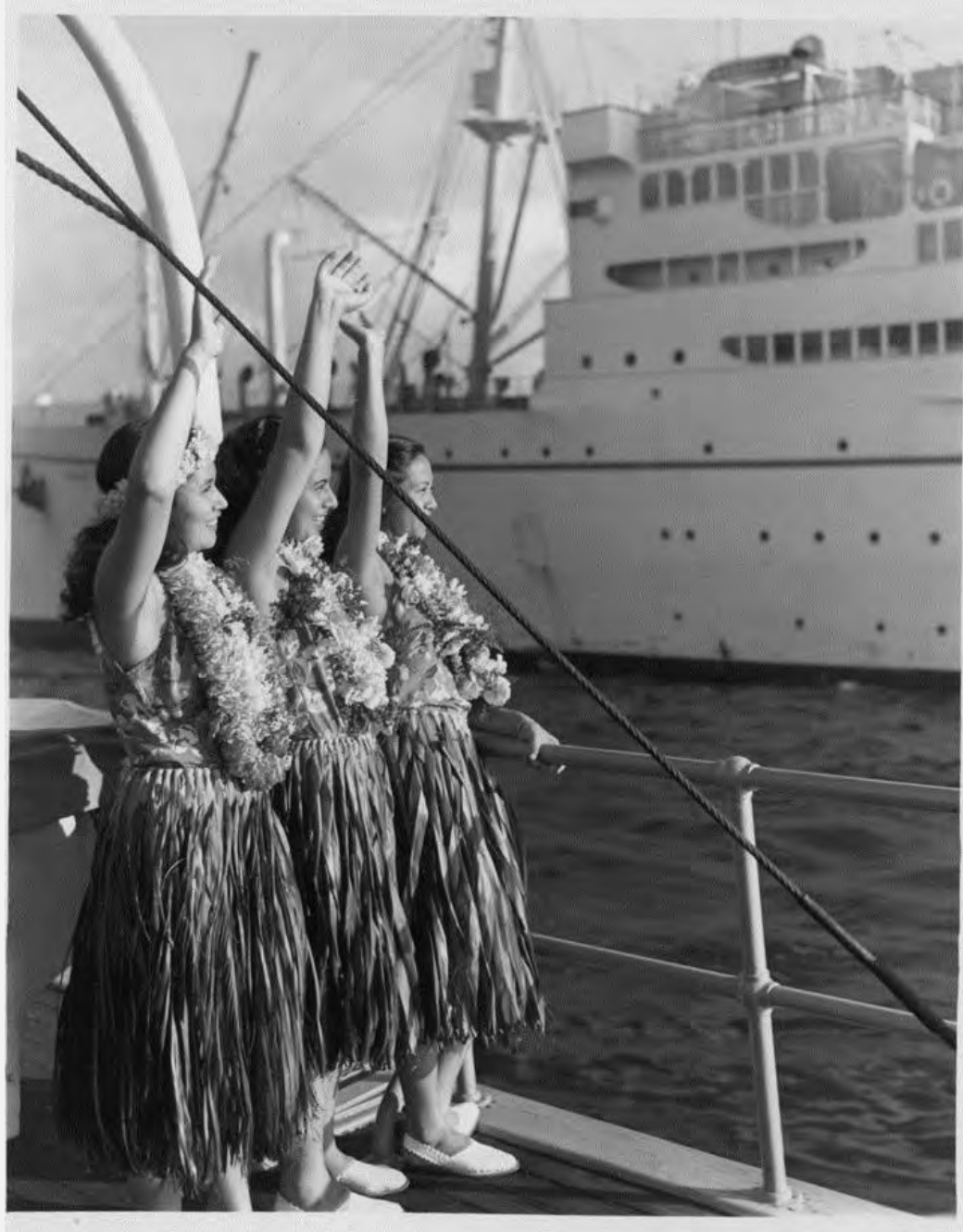
1935 Greeting the S.S. Matsonia