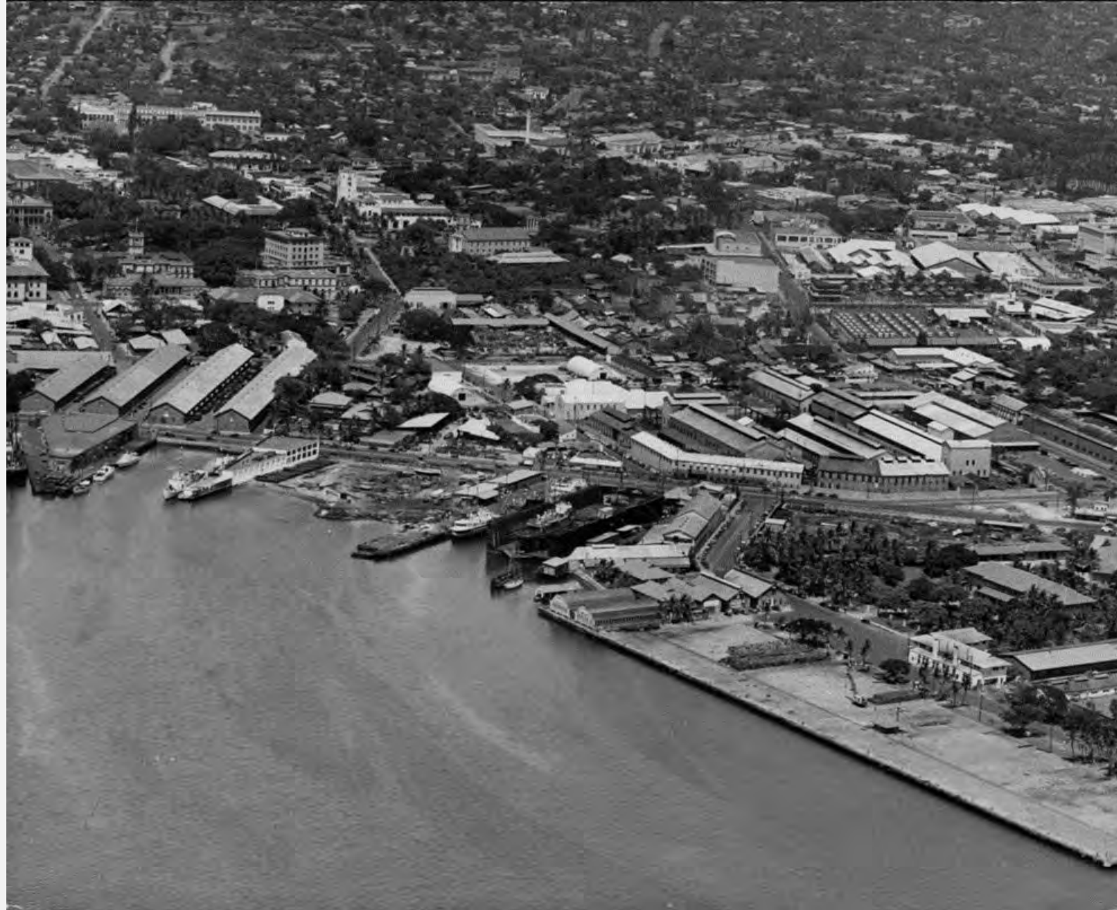
1940 Immigration Station and Kaka'ako