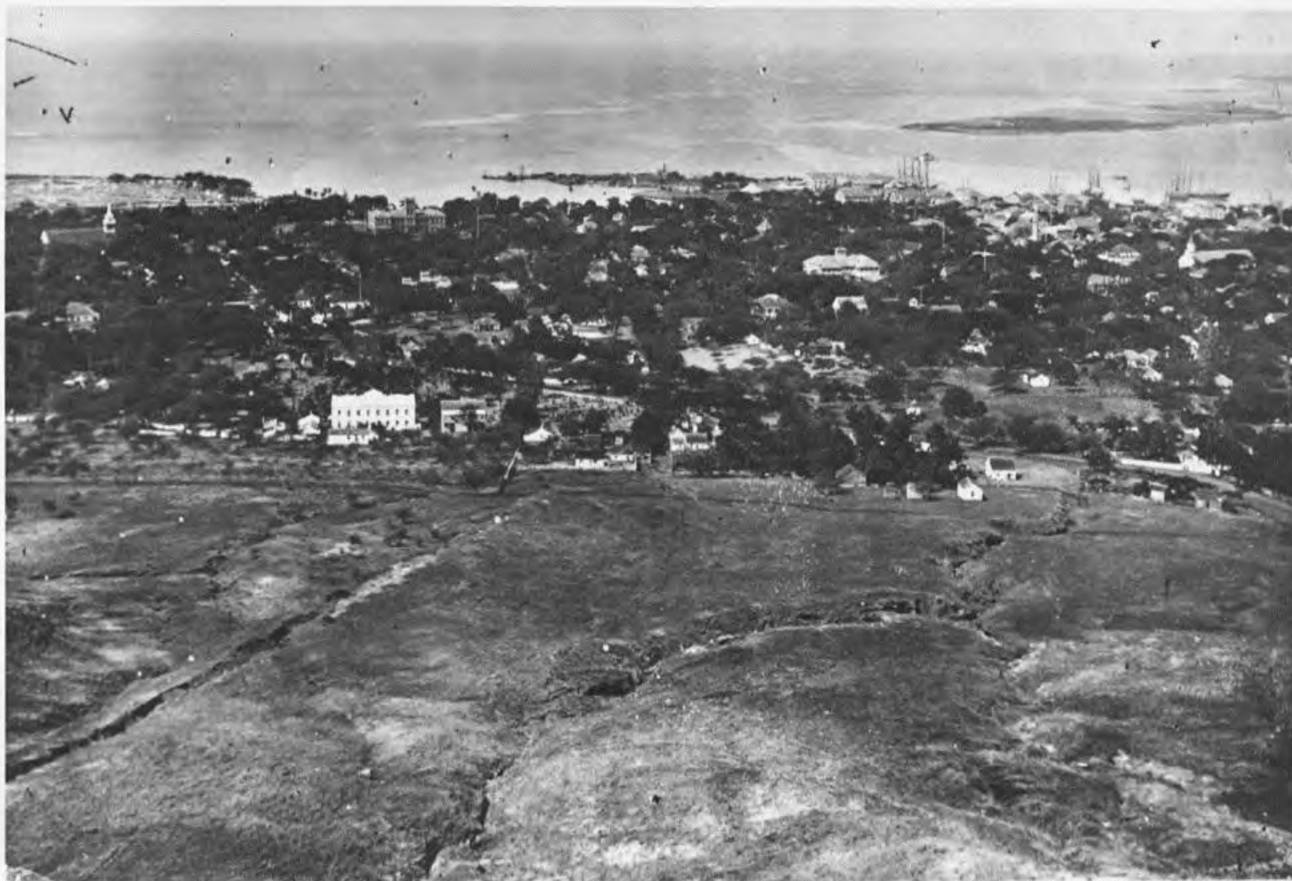
1879 View From Punchbowl