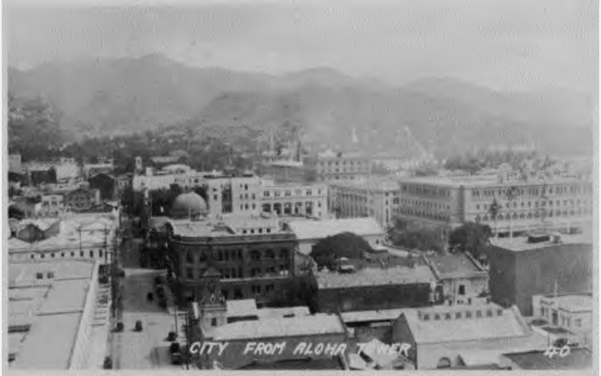
1928 View from Aloha Tower