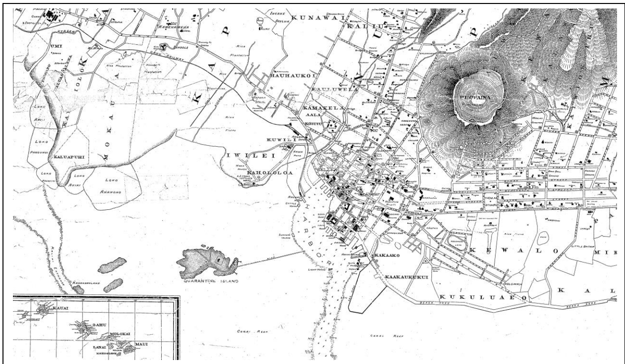
Makai Lands of Kahauiki to Kalia Waikiki (Portion of Register Map No. 1910)