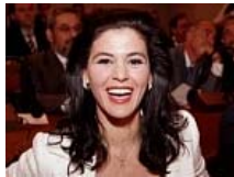
25 Congresswomen Who Are Strikingly Beautiful