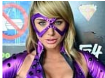
12 Hottest Cosplay Girls Ever