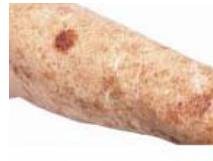
Beverly Hills Plastic Surgeon's Way To Remove Dark Spots Without Surgery.