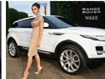
Don't buy an SUV before reading this. Expert opinions on the best 7 safest & most reliable SUVs