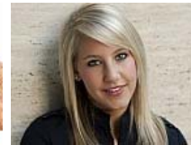
Forget Googling Someone's Name & Try This New Site Instead!