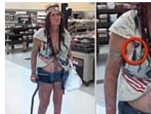
These 79+ People Spotted @ Walmart Are Beyond Messed Up. #16 Will Haunt Your Dreams Forever