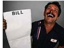
Stop buying junk cars! Photos of the best 5 most reliable cars. Stop getting huge mechanic bills now