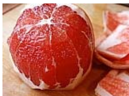
Do you know how healthy your liver is? Here are 15 tips for detoxing your liver.