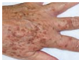
Beverly Hills Plastic Surgeon's Way To Remove Dark Spots Without Surgery.