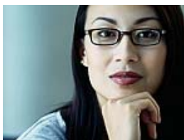
Monitor your credit. Manage your future. Equifax Complete™ Premier.