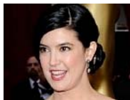
These successful stars made a voluntary decision to wrap up their show biz careers.