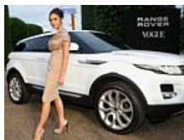
Don't buy an SUV before reading this. Expert opinions on the best 7 safest & most reliable SUVs