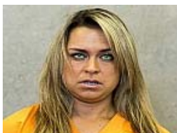
Honolulu residents are 'shocked' by controversial new site exposing personal information.